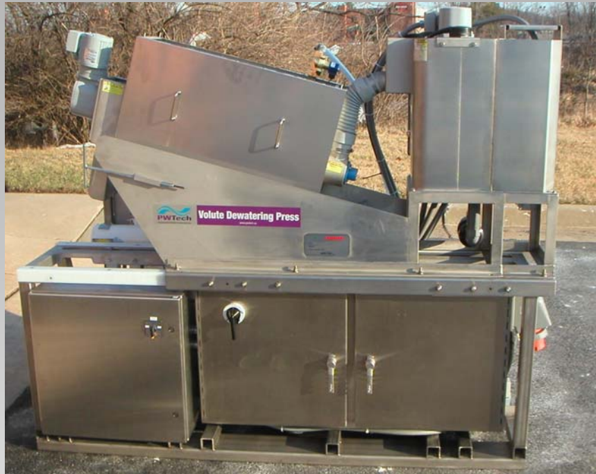
New ES131 Pilot Unit

PWT had finished its second Volute Dewatering Press pilot unit (see photo at right). This ES 131 is a slightly newer design than our existing KD202 Pilot unit. It is also quite a bit smaller which lends itself to indoor applications. While our goal is ultimately to put this unit in an enclosed trailer, in the interim, we are transporting it in a storage crate meaning it is well protected and should arrive at sites completely undamaged which is sometimes an issue with the current pilot.